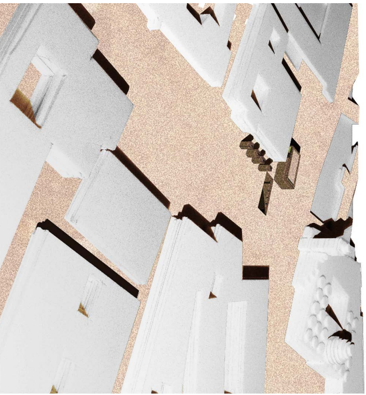
view of the square

The architecture in New Gourna is excavated in the soil. Earth and air, full and empty, positive and negative. There is a formal simplicity, an original appearance that is not at odds with the complex soul of the spaces which contains. The light and the shade are the main tools of this architecture. In spite of the short age of the village, there is a certain non-temporality. The state of neglect of the constructions gives it a character of inhabited ruin. The whole town is a Metaphysical landscape where the proposal tries to become a part of it, disappearing as a building, and becoming a concept.